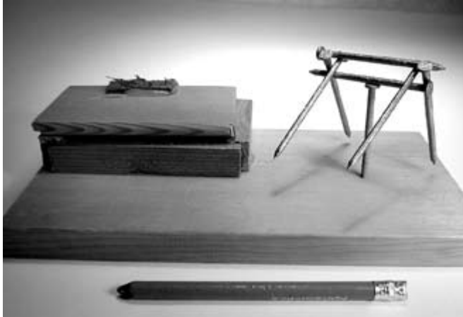
Figure 81. The nail puzzle.

The object of the nail puzzle ( Figure 81 ) is to balance six nails on top of the standing nail. I usually just show kids how to do it since it is a very hard puzzle to figure out. Kindergartners can learn to do the nail puzzle if they're motivated, although it may take more than one try.